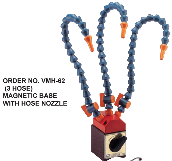
ORDER NO. VMH-62 (3 HOSE) MAGNETIC BASE WITH HOSE NOZZLE