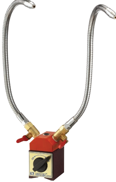
ORDER NO. VMH-64 (2 HOSE) MAGNETIC BASE WITH STEEL NOZZLE