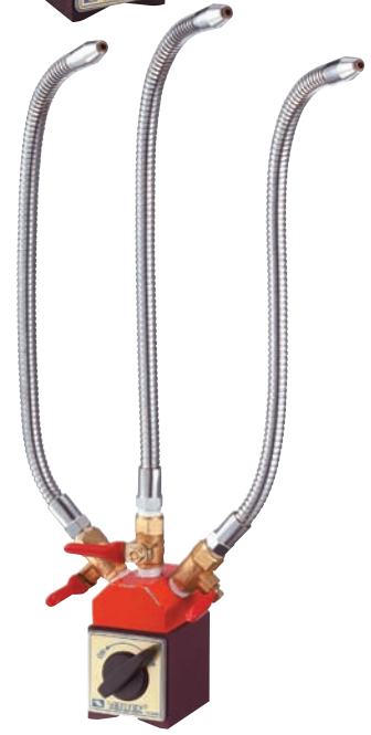
ORDER NO. VMH-65 (3 HOSE) MAGNETIC BASE WITH STEEL NOZZLE