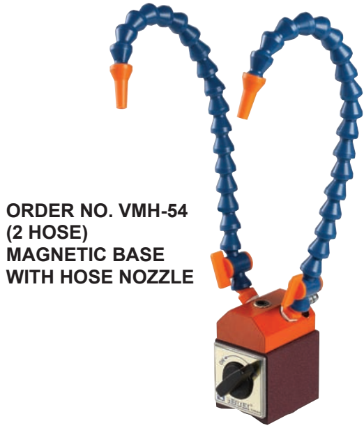
ORDER NO. VMH-54 (2 HOSE) MAGNETIC BASE WITH HOSE NOZZLE