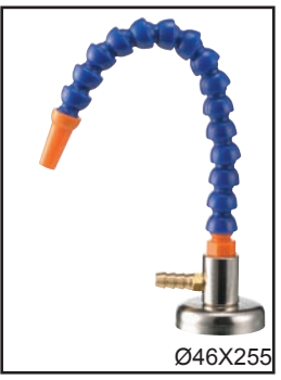
S-1 MAGNETIC FORCE 8kgs