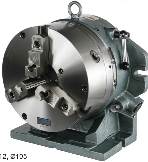
CC-12, Ø105 BIG THROUGH HOLE DESIGN