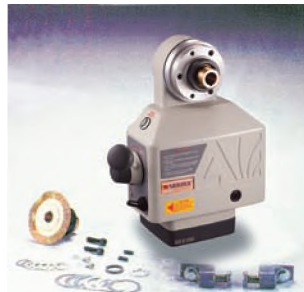
For Longitudinal X Axis

500S Type series VPF-500X VPF-500Y VPF-500Z