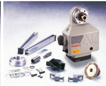
For Cross Y Axis