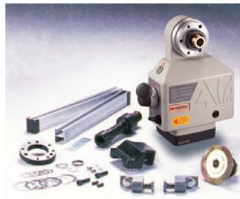
For Vertical Z Axis