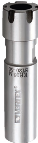
MINI TYPE NUT