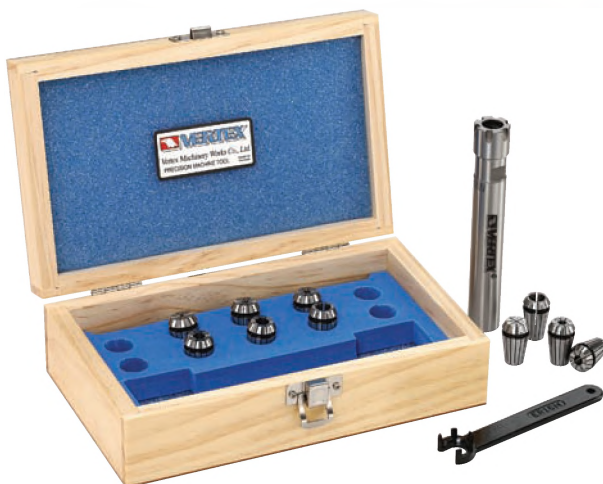
MINI TYPE NUT